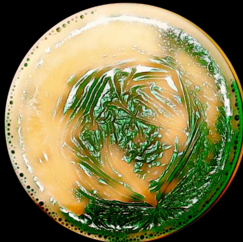
One sided Wrinkles